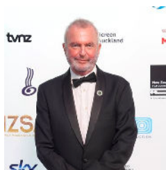
3 December 2025