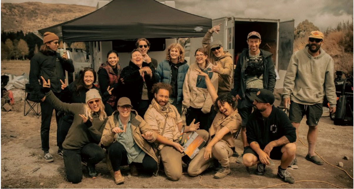
Image: Team photo from PLANET 13